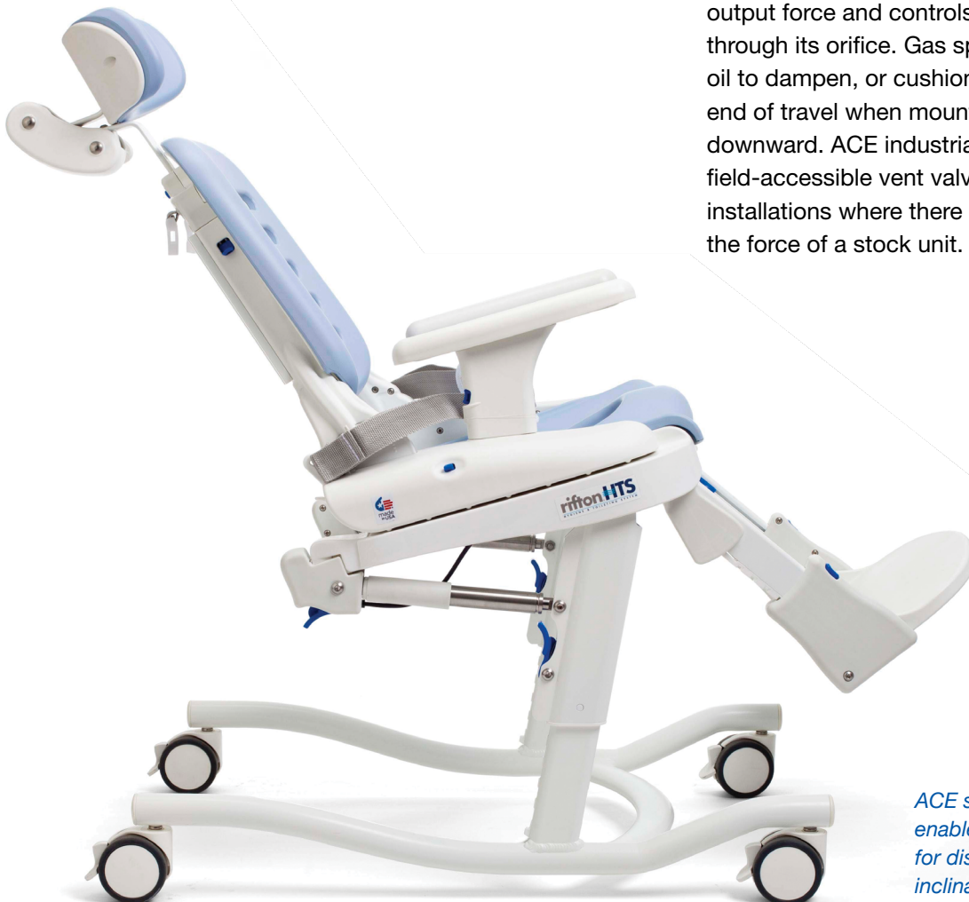
ACE stainless-steel locking gas springs enable this hygiene and toileting system for disabled children to reach 15-degree inclination angles to the front and rear.

Gas springs are a self-contained, force generating, maintenance-free cylinder. The body is pre-charged with nitrogen gas to provide a specific output force. The pressure is applied to the net piston and diameter area, which provides the output force in push-type gas springs. Except for a small increase in progression force as the piston rod is compressed, the piston provides a constant output force and controls the velocity by metering the gas through its orifice. Gas springs contain a small volume of oil to dampen, or cushion, the movement at the extreme end of travel when mounted with the piston rod facing downward. ACE industrial gas springs also include a field-accessible vent valve for the occasional custom installations where there may be a need to further reduce the force of a stock unit.